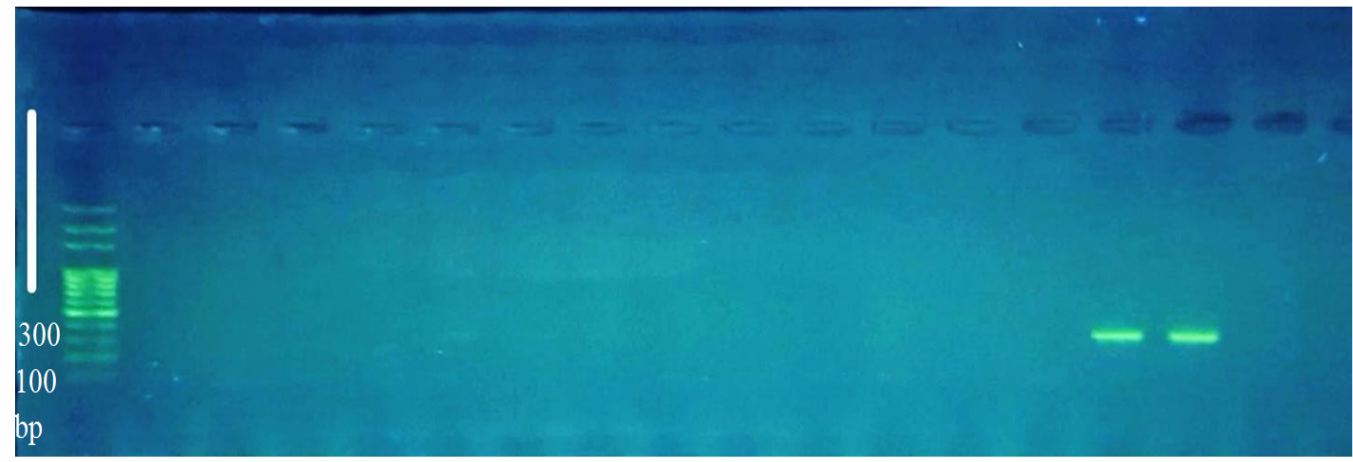
Fig. 2 : Agarose gel electrophoresis, of AlgD gene of P. aeruginosa responsible for the biofilm formation, AlgD amplicon to (313bp).

Strohl et al. , (2013) reported that P. aeruginosa produces an exopolysaccharide named alginate, protect the bacteria for changed environmental conditions and encourages bond to solid surfaces.